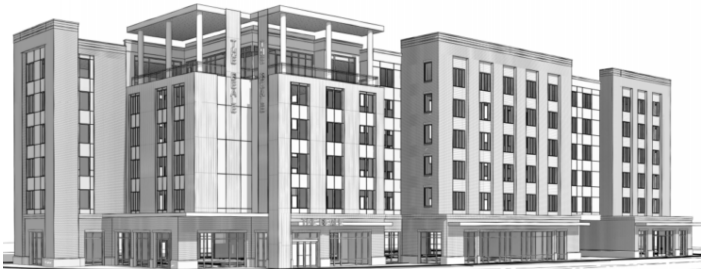
Rendering of the hotel planned for 380 Beale. (Credit: Elevate Architecture Studio)

No name for the boutique hotel has been chosen, Patel said Thursday night, even though one rendering includes a sign stating "The Beale." Patel said that was a placeholder name.