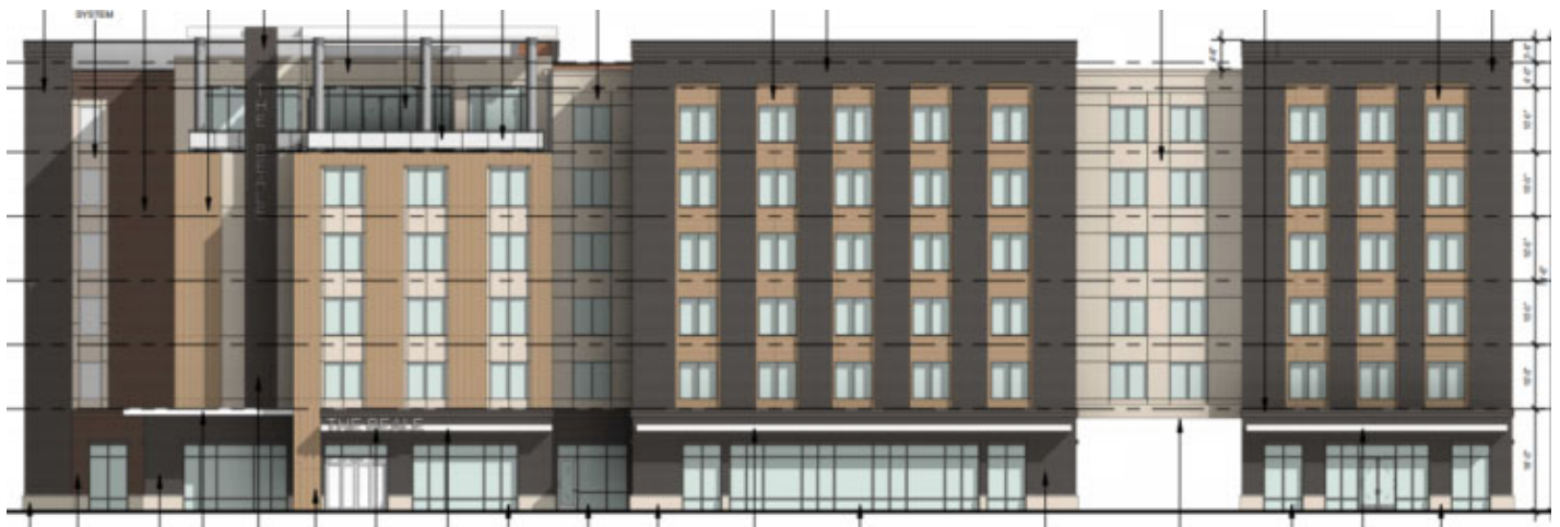
The hotel at 380 Beale would be six stories and have 145 guestrooms. (Credit: Elevate Architecture Studio)

“The design of the hotel at 380 Beale St. substantially aligns with the recommendations of the Downtown Design Guidelines. The building addresses the street, keeping parking (which will be facilitated off-site) visually subordinate to the structure.